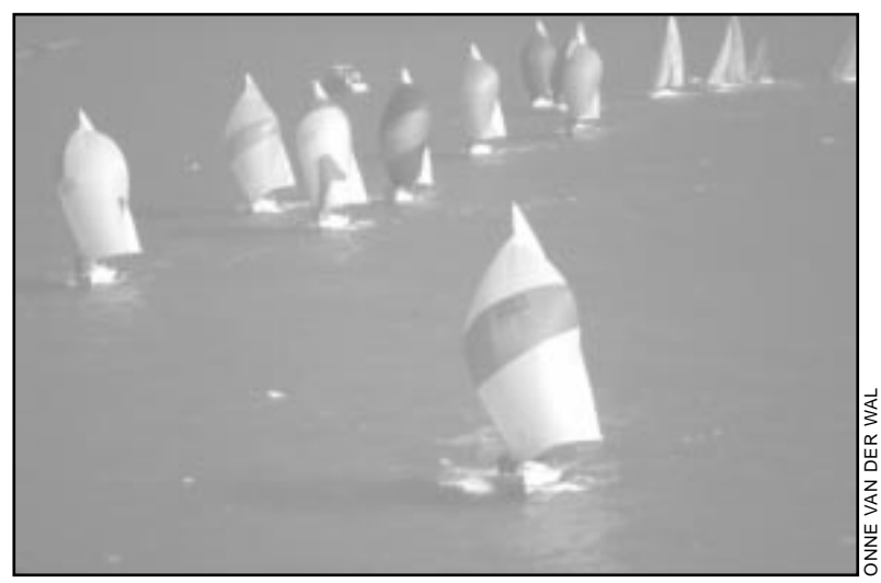
PLUM CRAZY leads the way to the leeward mark.