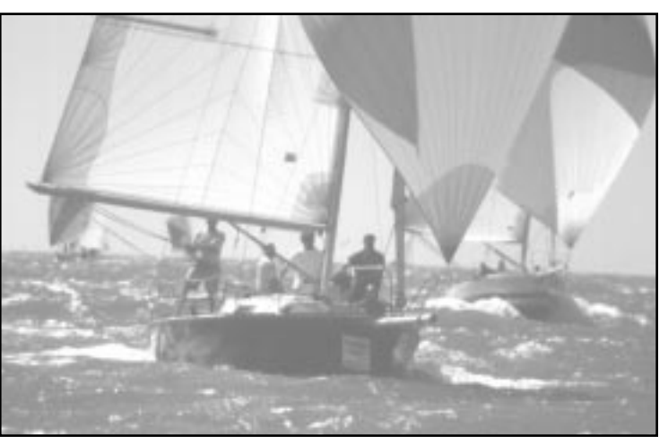
Eclipse surfs downwind in excellent form